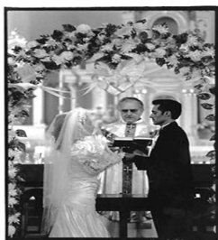
Most observers agree that the social institution of marriage is substantially weaker than it was a half-century ago.